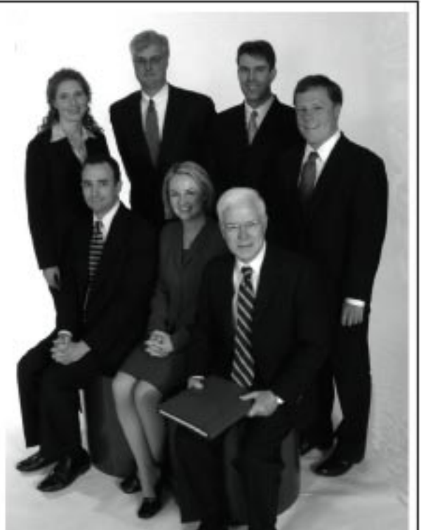
MUNICIPAL AND PUBLIC FINANCE GROUP

In accordance with the Alabama State Bar requirements, no representation is made that the quality of the legal services to be performed is greater than the quality of legal services provided by other lawyers.