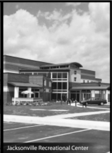
Jacksonville Recreational Center