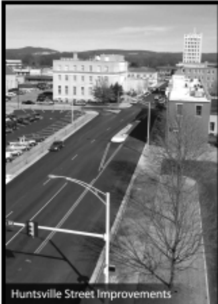
Huntsville Street Improvements